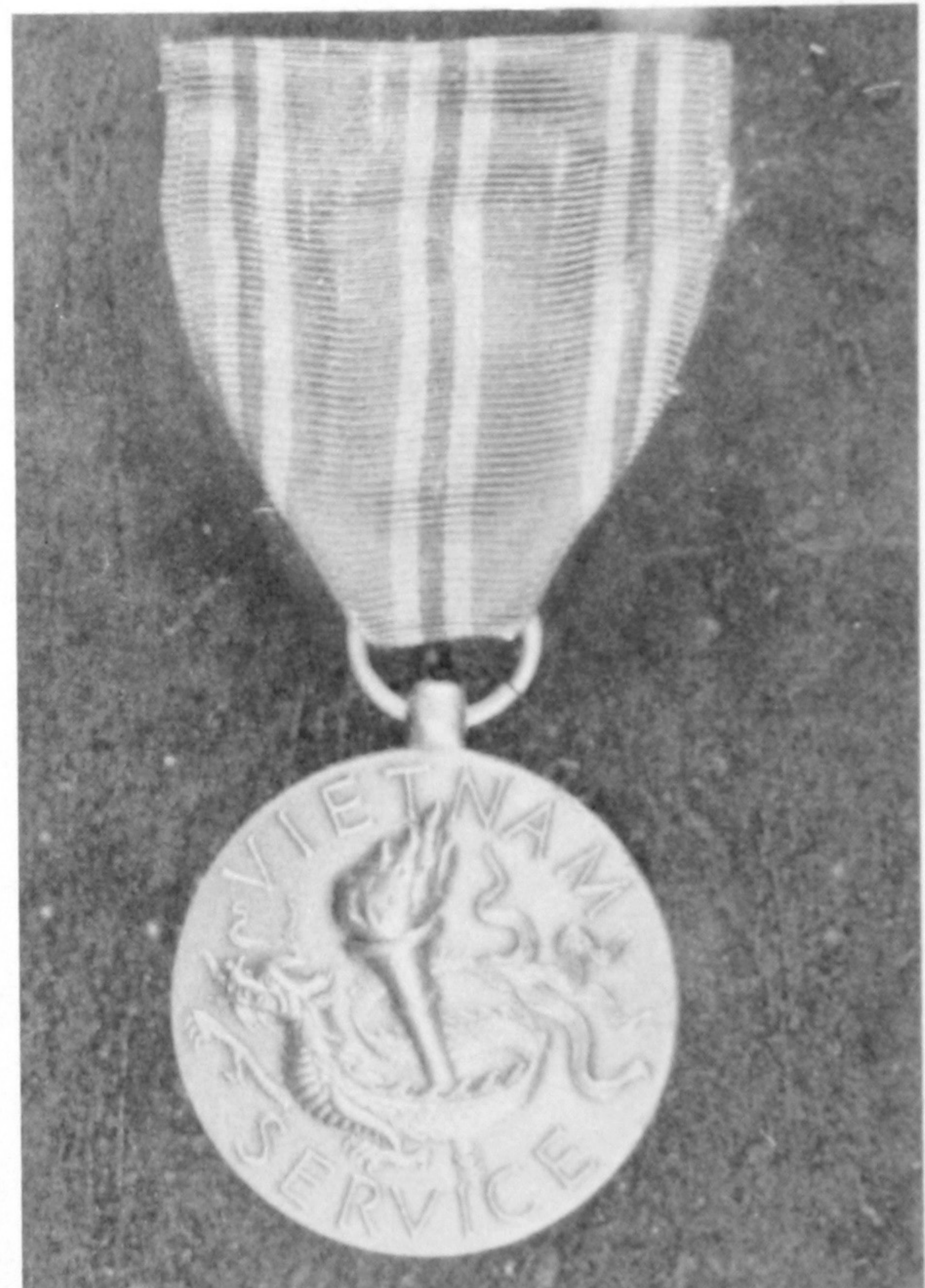
NIS Special Agents who served in Vietnam for one year received the civilian Vietnam Service Medal shown above. The background is dark blue with yellow and red stripes.

background investigations, asking fifty times a day, "Is he honest, loyal, trustworthy, and would you recommend him for a position of trust"? (The rough notes read, "HLT POT".) Others volunteered for the opportunity to be reassigned to a NISRA of their choice if and when they made it back alive. To be candid, organizational promises to return an agent to the office of his choice were not always kept. Still others,