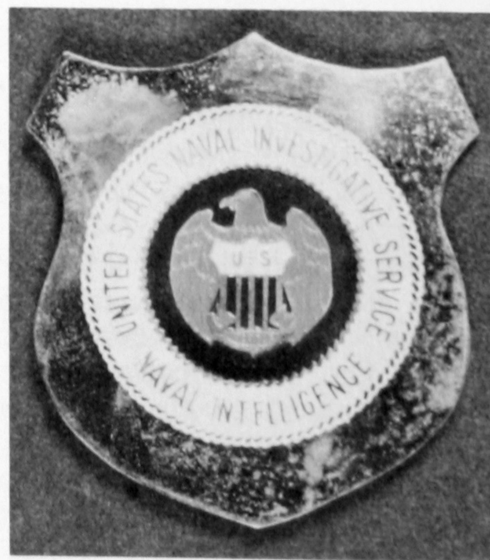
BADGE AND CREDENTIALS ISSUED TO S/A BISCOMB IN VIETNAM