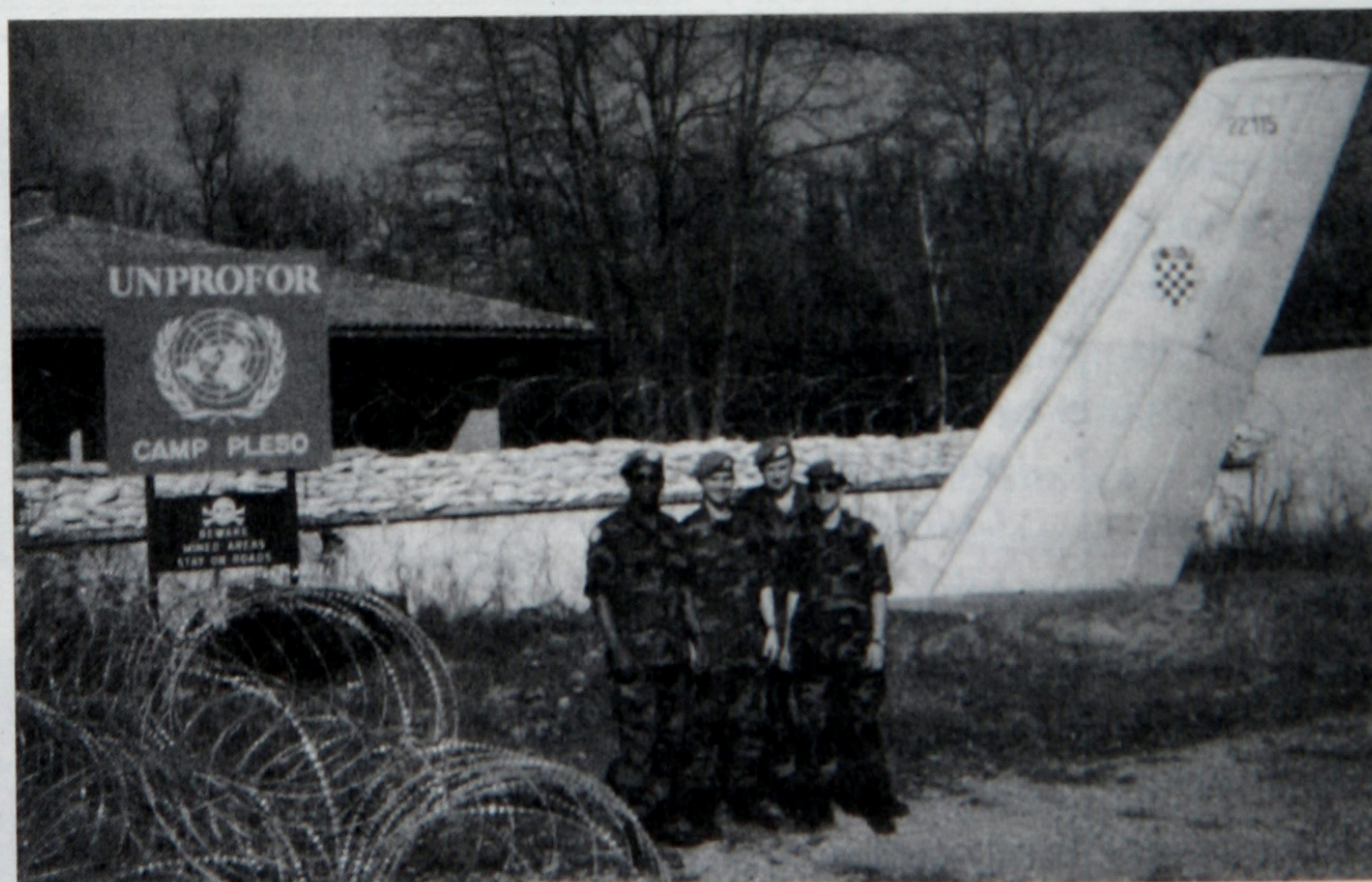
Special agents from the Air Force Office of Special Investigations (AFOSI) and NCIS gather for a group shot at Camp Pleso.

It is a program developed by the Department of Defense which mandates that counterintelligence organizations acquire information in coordination with Marine Corps Counterintelligence when appropriate on activities that may be